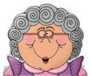
Let's put on an apron and get cooking!