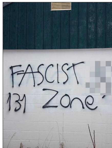
Two examples of graffiti messages defacing buildings at the State School property.

NSC 131 shares links to extreme organizations. Hood has previous affiliations with the neo-fascist group Patriot Front, the Proud Boys and the Base, a militant survivalist white supremacist group hoping for societal collapse. This ideology, embraced by many white supremacist groups, is known as accelerationism. Adherents believe that the United States must suffer total societal collapse so a white ethnostate can rise from the ashes. Both NSC 131 and the Base are known to practice firearms training. The Base is classified as a terrorist organization by